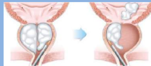
Removal of the enlarged prostate tissue with a laser resectoscope inserted through the urethra.